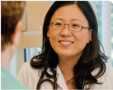
New urgent care center opens in Danvers