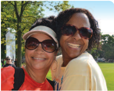
Another successful Cancer WALK